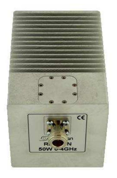
Figure 1. RFK-50N