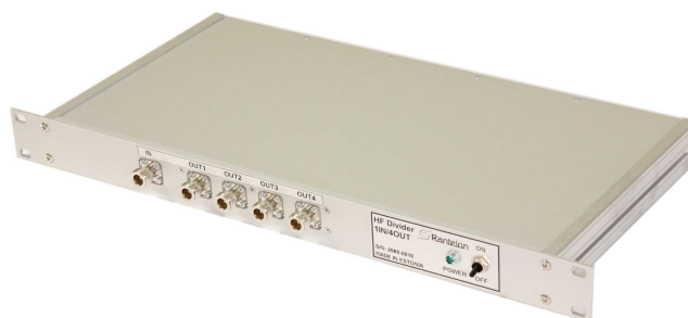
Figure 1: View of HF DIVIDER