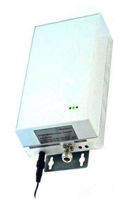
Figure 1: Repeater GR9P21 front view