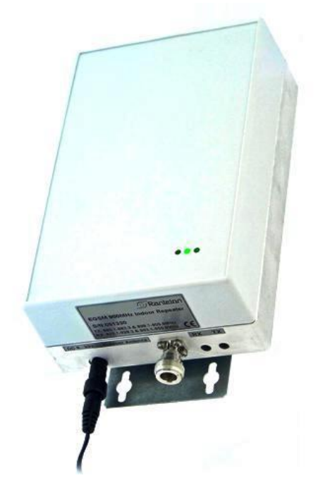
Figure 1: Repeater GR921-02 top view.