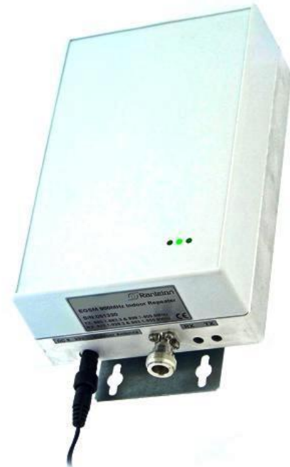
Figure 1: Repeater GR920-02 top view.