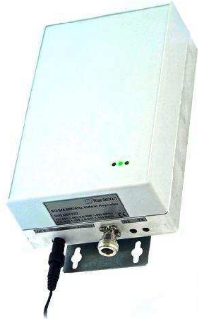
Figure 1: Repeater GR380-01 top view.