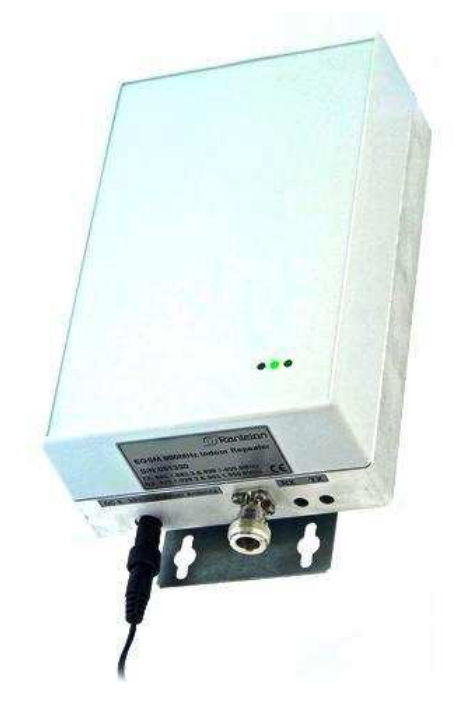
Figure 1: Repeater GR380-01 top view.