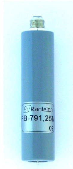
Figure 1: FB-791.25M.