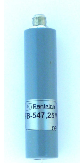
Figure 1: FB-547.25M.