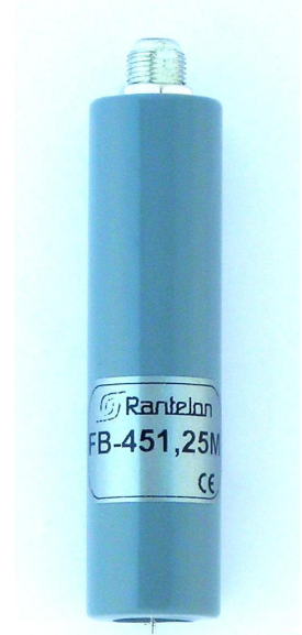
Figure 1: FB-451.25M.