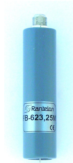
Figure 1: FB-623.25M.