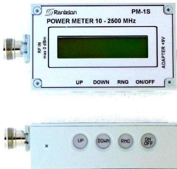
Figure 2: PM-1S top and side view.

Built-in battery level indicator (right lower corner of LCD) shows remaining power of 3xAA-type cells. If level is equal to 4.5V (or above) the indicator will show 9. In case of low level (3.1V or less) value is 0. Built-in charger allows external charging/powering with any kind of power supply with +9V output.