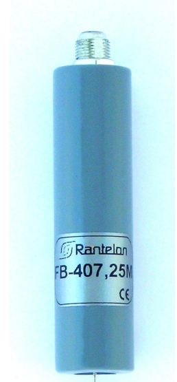
Figure 1: FB-407.25M.