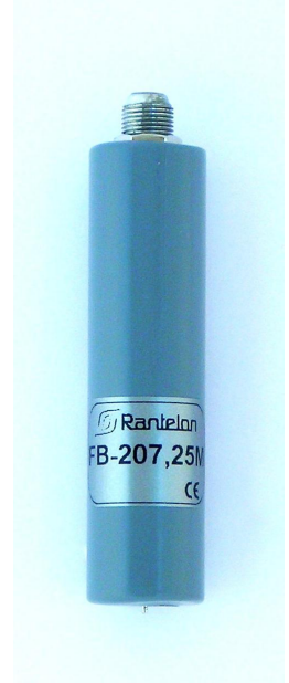
Figure 1: FB-207.25M.