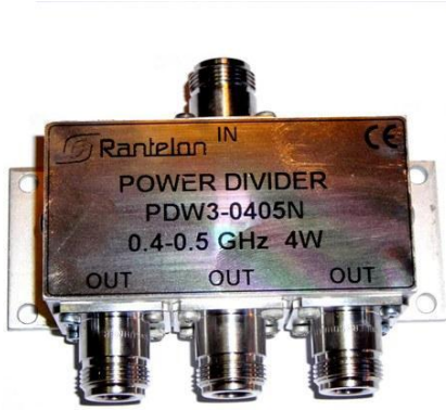
Figure 1: PDW3-0405N top view.