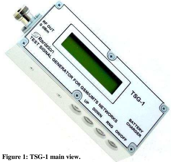
Figure 1: TSG-1 main view.