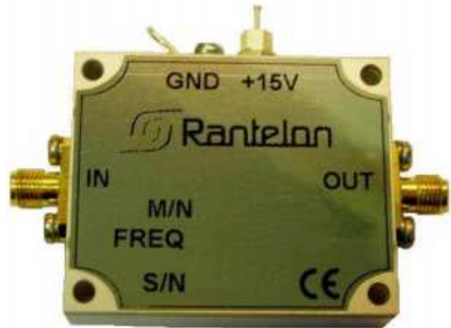
KA1406 mechanical enclosure.