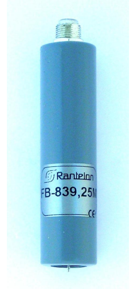
Figure 1: FB-839.25M.