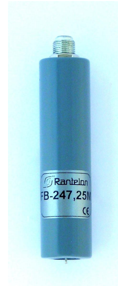
Figure 1: FB-247.25M.